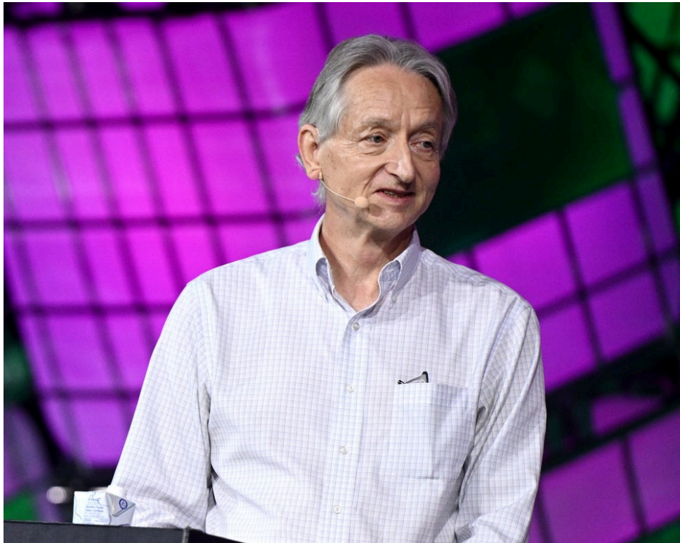
Geoffrey Hinton, Godfather of AI.

“I didn't think I had been a rat, so it didn't make me feel too bad,” he told FT . “I met somebody I liked more, you know how it goes.”